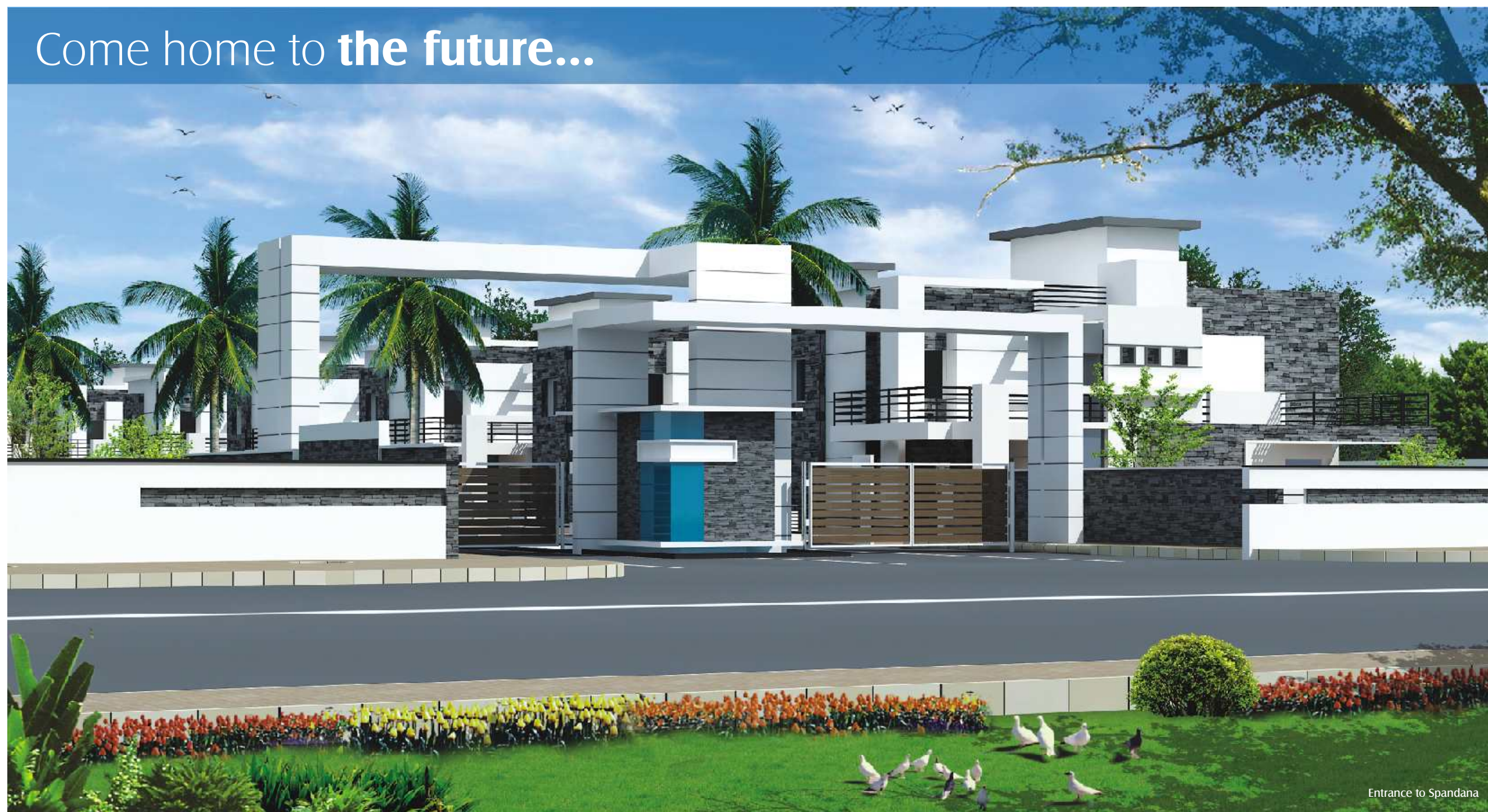
Entrance to Spandana